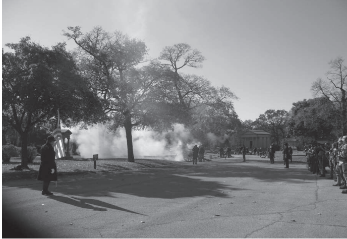
An artillery salute is fired.

On Veterans Day Rosehill Cemetery hosted a salute to our nation's veterans, something the past 10 years. Several Civil War (and other) re-enactor groups experience. Some photos are below.