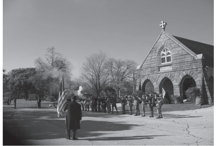
A 21 gun salute, in front of the Rosehill Chapel.