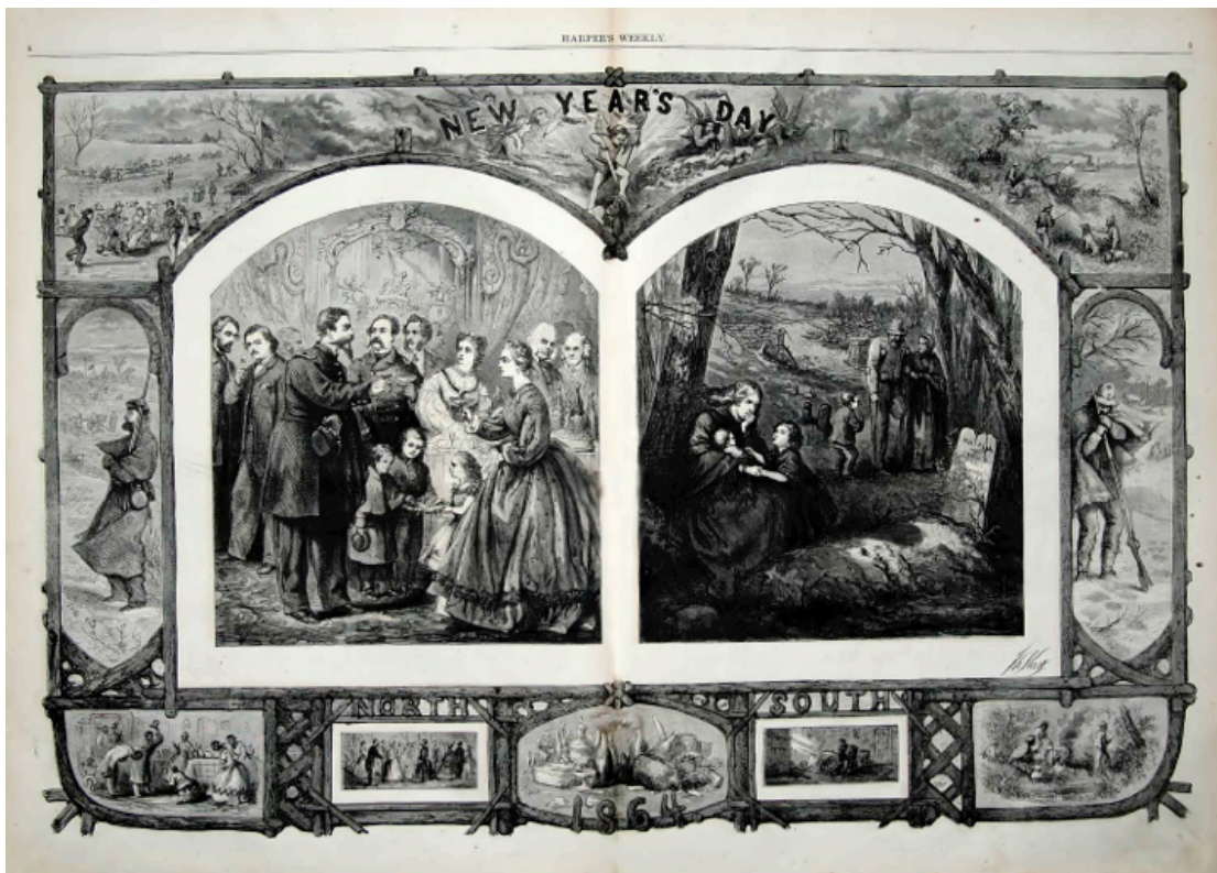
From Harper's Weekly , January 2, 1864

The funeral was Monday, Dec. 29th, at West Lawn Cemetery, 7801 West Montrose Avenue in Norridge. (courtesy Rae Radovich)