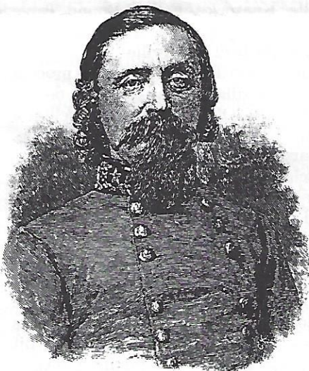
Major General George E. Pickett